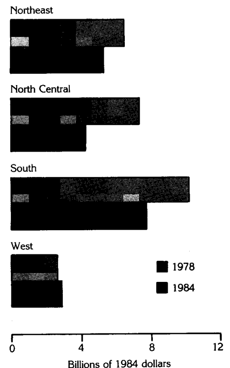
Figure 3 South and North Central region make most progress in constructing rural water treatment facilities

The sewage treatment needs of rural America are large and varied. Funding them will become the sole responsibility of State and local governments by 1995. A myriad of solutions will undoubtedly emerge. Whatever the approach, three basic steps should guide rural policymakers. The first step is to identify, with precision and in detail, rural problem